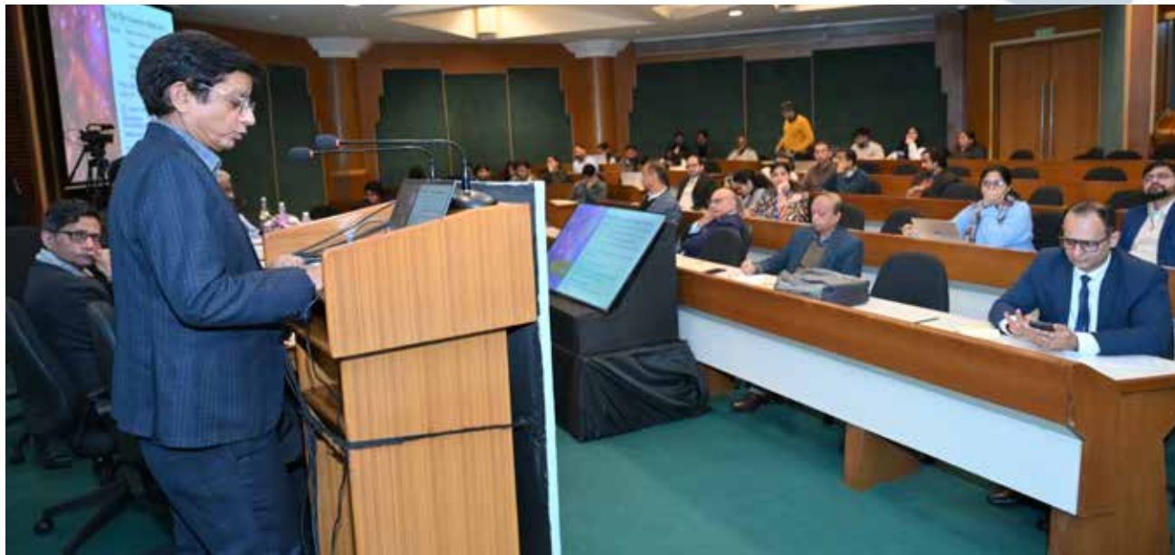
Shri Ganesh Dutt Lohani, addressing the session.

As part of the Brainstorming Series ahead of the 14th WTO Ministerial Conference (MC14), Research and Information System for Developing Countries organised the fourth brainstorming session on “E-Commerce Moratorium and New Landscape of Trade, Investment, and Services” on 30 January 2026. The discussion brought together policymakers, trade experts, academics, and practitioners to deliberate on the implications of the WTO e-commerce moratorium for developing countries and the evolving digital trade landscape.