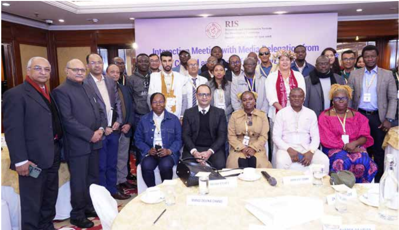
Media Delegation from Central and West Africa at RIS for Deliberations on South-South Cooperation.

On 14th January 2026, RIS hosted a media delegation from Central and West African countries as part of its ongoing engagement with partners from the Global South.