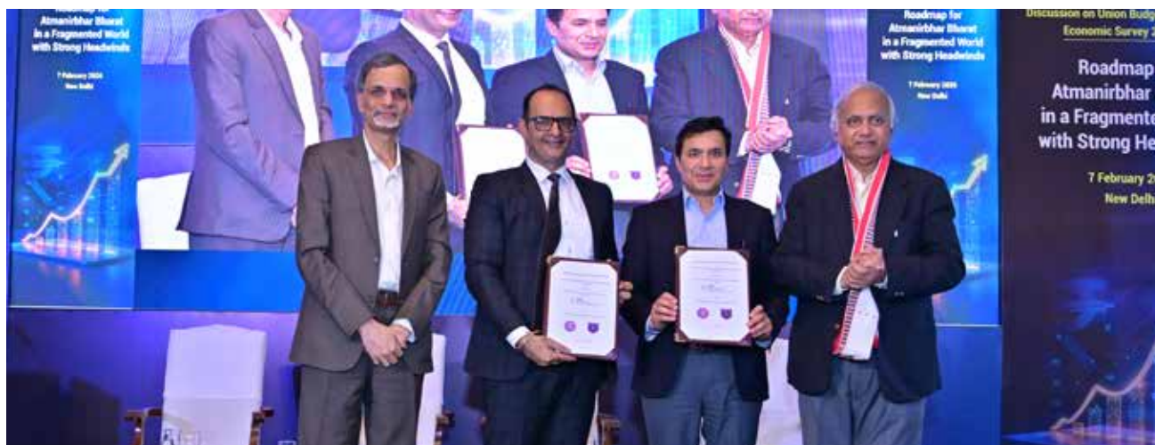
Discussion on Union Budget 2026-27 and Economic Survey 2025-26 'Roadmap for Atmanirbhar Bharat in a Fragmented World with Strong Headwinds'

observed that the fragmented global environment presents both opportunities and risks for India. While high public capital expenditure remains necessary due to infrastructure gaps and weak private investment, manufacturing continues to remain a weak link despite its employment potential. He highlighted that