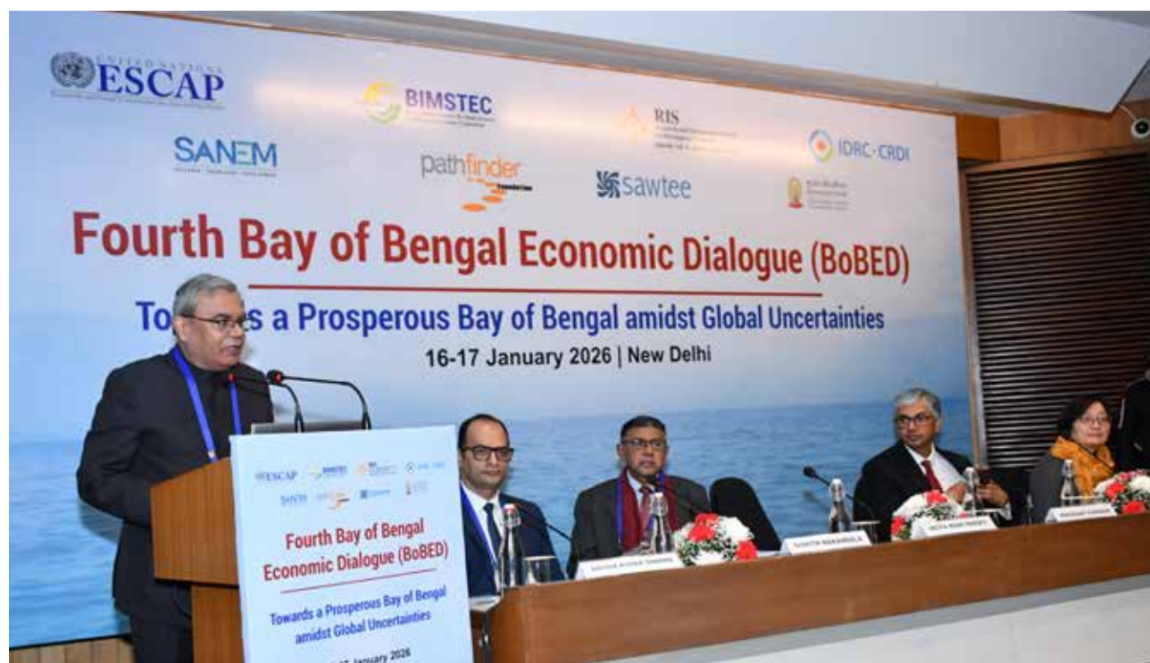
Inaugural Session of the Fourth Bay of Bengal Economic Dialogue.