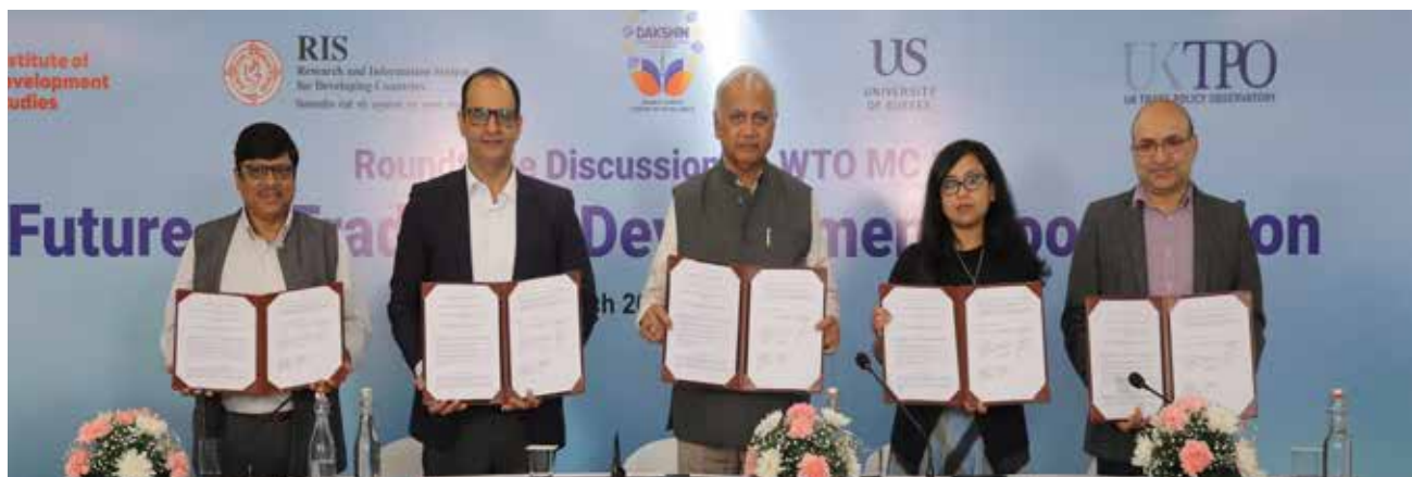
Signing of the MoU between RIS and IDS, the University of Sussex, and UKTPO during the roundtable discussions on 'WTO MC14 Future of Trade and Development Cooperation'.

RIS in collaboration with the UK Trade Policy Observatory (UK TPO), and the University of Sussex, convened a Roundtable Discussion on the 'WTO MC14 Future of Trade and Development Cooperation' on 18 March 2026 at Tamarind Hall, IHC, New Delhi. The discussion was structured in two sessions along with an inaugural session.