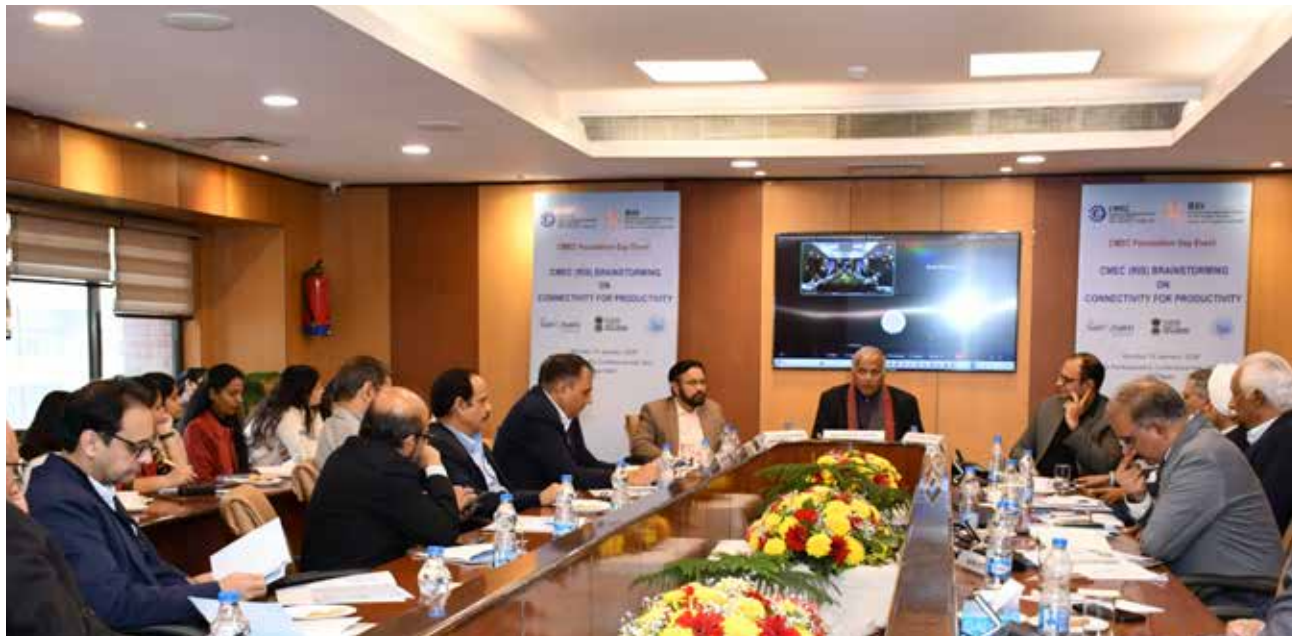
Proceedings at the Panel Discussion on 'Connectivity for Productivity: Ports as Production Engines'.

Centre for Maritime Economy and Connectivity (CMEC), at RIS, marked its Foundation Day with a high-level panel discussion on “Connectivity for Productivity: Ports as Production Engines” on 19 January 2026. The discussion focused on leveraging the PM GatiShakti National Master Plan to strengthen multimodal logistics integration, coastal shipping, and inland waterways connectivity.