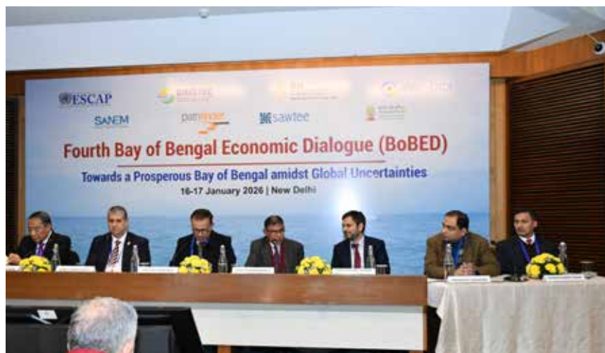
Panelists of the Fourth Bay of Bengal Economic Dialogue (BoBED), held at the India Habitat Centre (IHC), New Delhi.